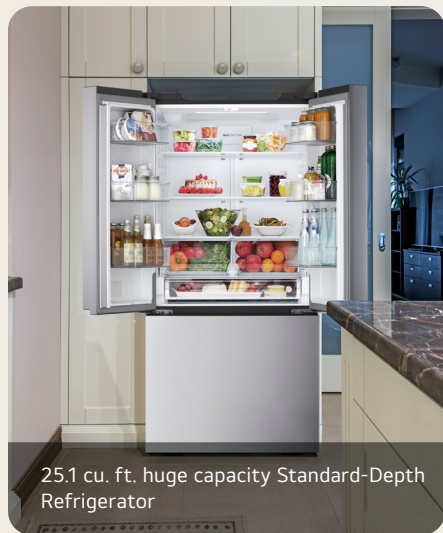
25.1 cu. ft. huge capacity Standard-Depth Refrigerator

33" 25.1 cu. ft. Standard-Depth 3-door french door refrigerator