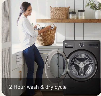
2 Hour wash & dry cycle

5.7 cu. ft. mega capacity Smart WashCombo™ All-in-One washer/dryer