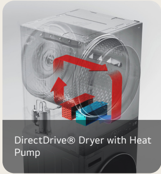
DirectDrive® Dryer with Heat Pump

Single Unit LG WashTower™ with Center Control™ 5.8 cu. ft. Front Load Washer and 7.8 cu. ft. Electric Ventless Heat Pump Dryer