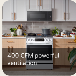
400 CFM powerful ventilation