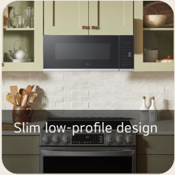
Slim low-profile design