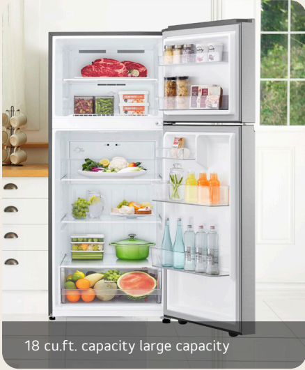
18 cu.ft. capacity large capacity