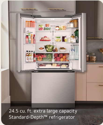
24.5 cu. ft. extra large capacity Standard-Depth™ refrigerator

33" 24.5 cu. ft. Standard Depth 3-door french door refrigerator