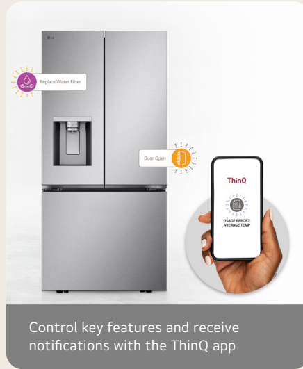
Control key features and receive notifications with the ThinQ app