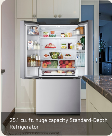
25.1 cu. ft. huge capacity Standard-Depth Refrigerator

33" 25.1 cu. ft. Standard-Depth 3-door french door refrigerator