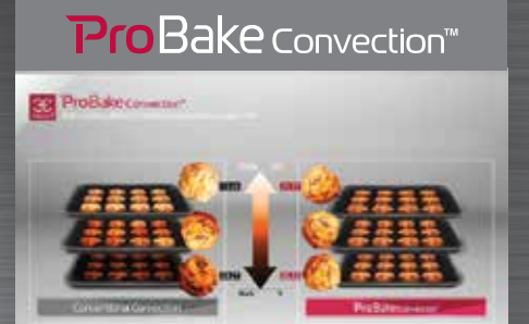
Even Cooking, Even Faster

LG EasyClean® brings you our fastest oven-cleaning feature yet. In just three steps your oven can sparkle, all without strong chemical fumes or high heat.